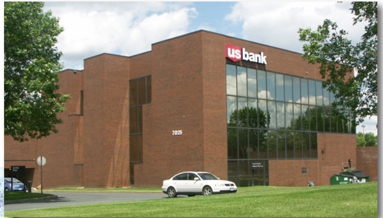
Town Center Office Plaza