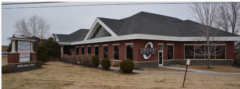
Plymouth Office Center