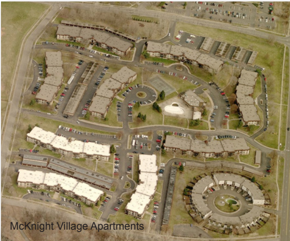
McKnight Village Apartments