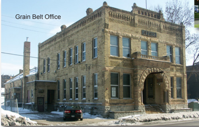
Grain Belt Office