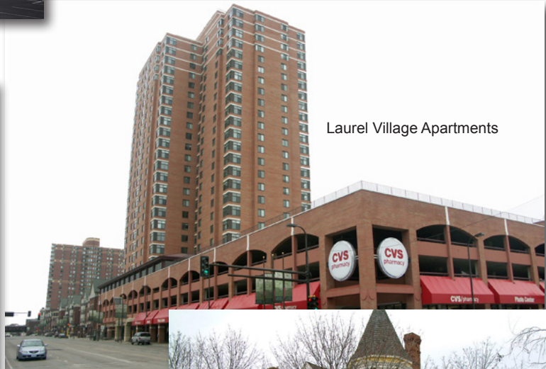
Laurel Village Apartments